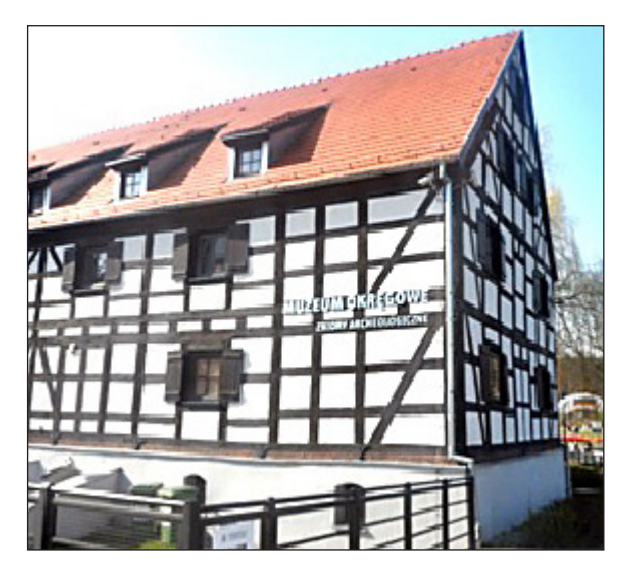
Fig. 1. District Museum in Bydgoszcz

The Leon Wyczółkowski District Museum, archeological collections in Bydgoszcz, Mennica Street 2 (Fig. 1) was chosen to check the parameters of the internal air in the museum. This is a two-tier building with the basement and the attic. The building was constructed after 1789 and was called the White Granary. Originally, it functioned as a reloading granary and the grain warehouse for the nearby mills. Since 2009, the White Granary has been used for archeological collections of the District Museum. The building has a frame construction. The construction of the walls includes: wattle and daub with the thickness of 6 cm, highly vapour-permeable foil, mineral wool with the thickness of 10 cm, polyethylene foil, gypsum boards. The walls have not been thermally modernized. The building has old window woodwork. There are mainly areas of exposition spaces, office and break rooms. The