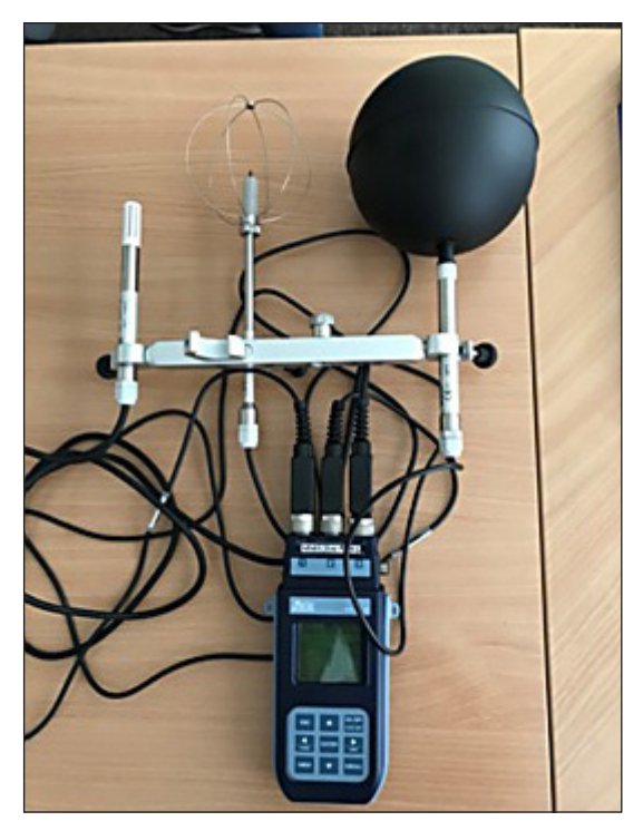
Fig. 3. Delta OHM HD32.3 meter

Taking into consideration the data from Table 1 and the conclusions from the observation of the museum exposition, it can be specified that the temperature of the internal air should be between