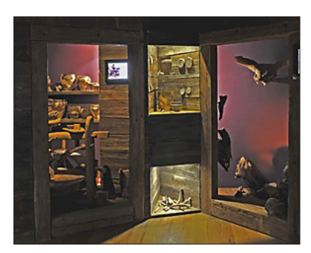
Fig. 2. Exhibition of archaeological collections

During taking the measurements of the air parameters inside the rooms, some windows were open (but not all the time), all were covered with shades, the lighting and the ventilation at the exhibition were on, the computer at the counter and all the screens at the exposition were turned on. The measurement had been taken hourly since the opening of the museum. It was taken about 1 meter above the level of the floor. 8 representative points were chosen on the ground floor and